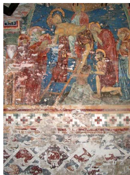
A scene of the paintings: Deposition from the cross . The faux marble dado with geometric motifs is seen in the lower part. The image shows the appearance of the paintings before the restoration.

The paintings completely cover the perimeter walls of the room and two octagonal-based pillars, and consist of forty-five scenes mainly representing stories from the Old and New Testaments, culminating in the three grand scenes of the Crucifixion , Deposition from the cross and Deposition in the sepulchre which occupy the centre of the southern wall. The scenes are accompanied by faux marble dadoes and other decorations.